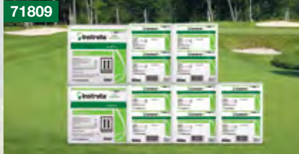
Contend Winter Solution