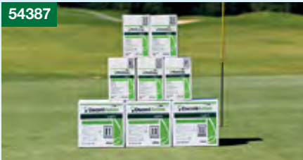
A 2 Z Solution