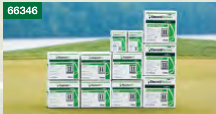
Greens Foundation Solution