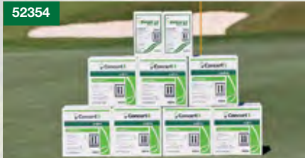
Snow Mold Solution