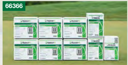
Greens Protection Solution