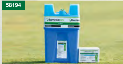
Warm Season Herbicide Solution