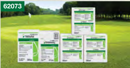
Fairy Ring Solution