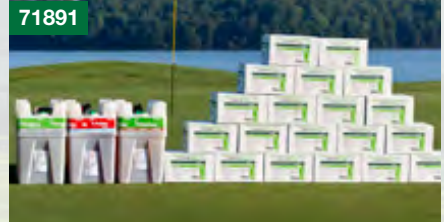
Fairway Starter Solution