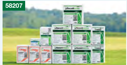
All Season Solution